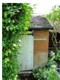
Milton's Cottage fountain and necessarium