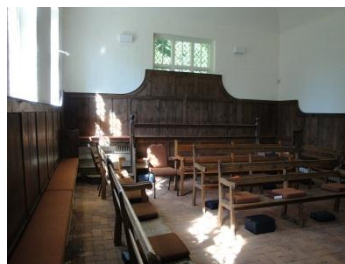
Jordans Meeting inside