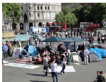
OCCUPY Trafalgar Square